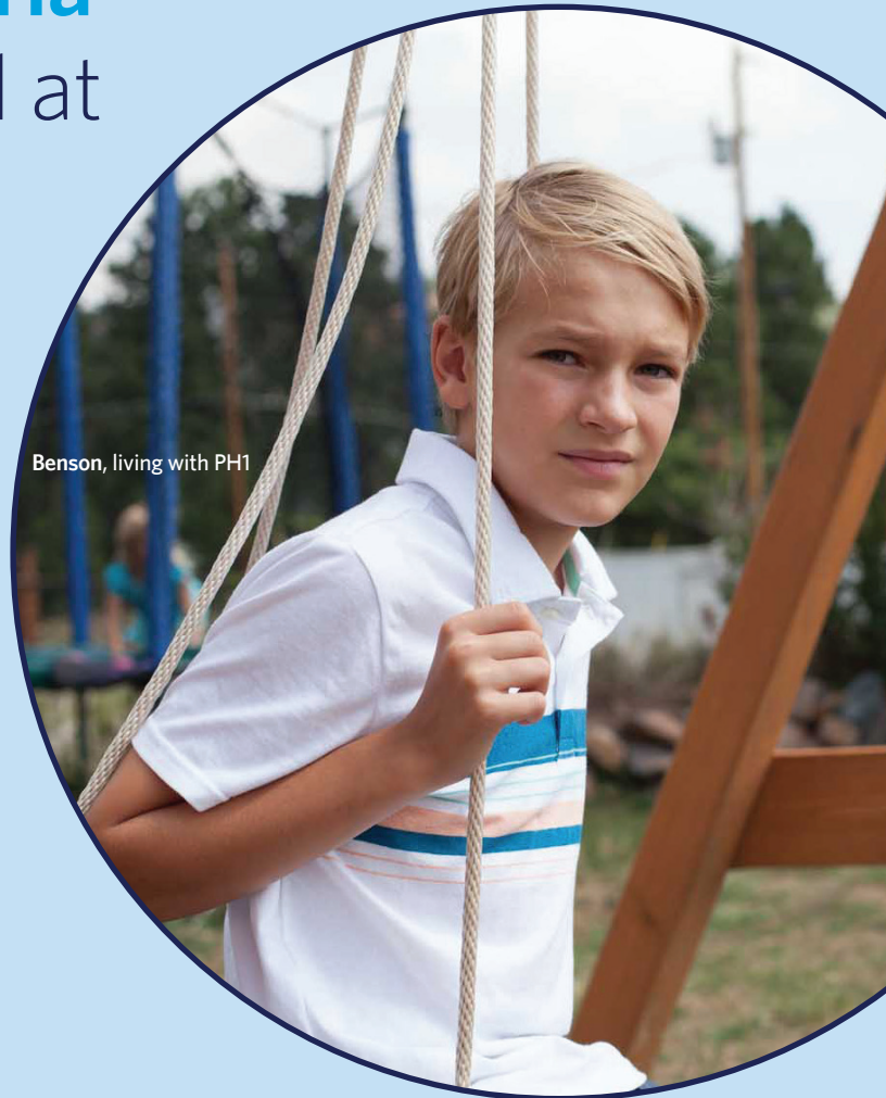
Benson, living with PH1

Your doctor will help you determine if genetic testing through Alylam Act ® is the right choice for you.